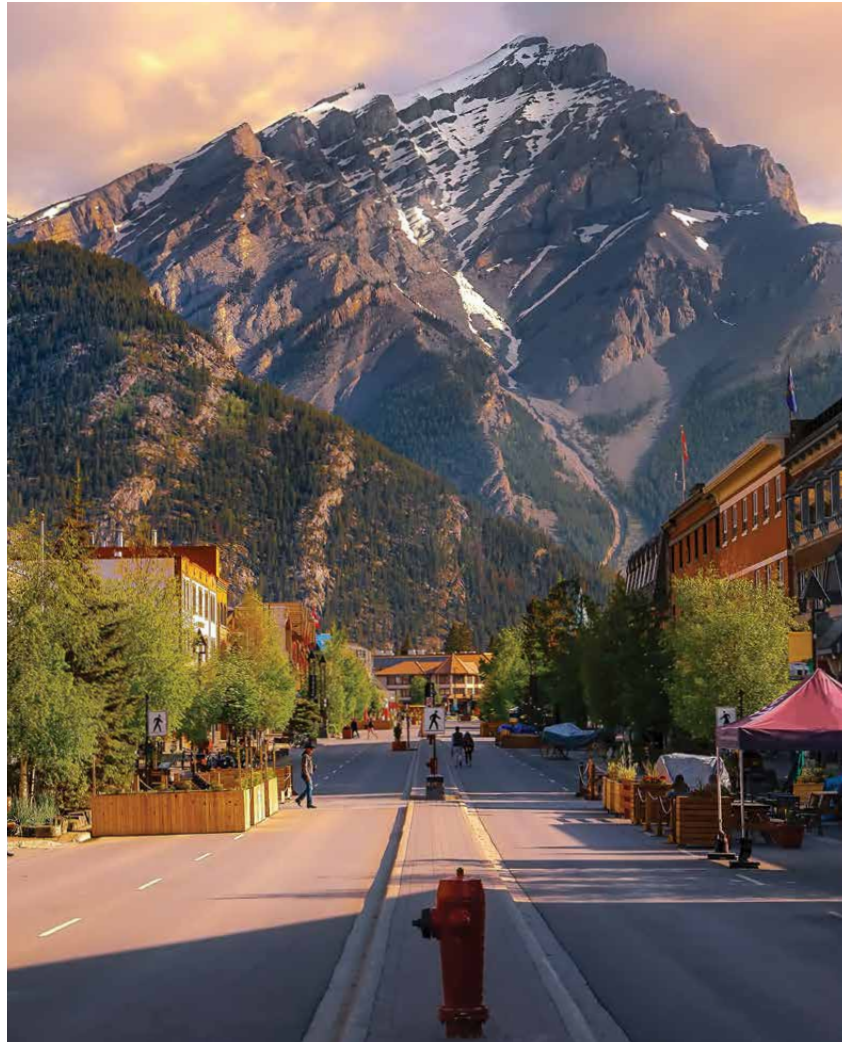
44 HOME BY DESIGN / The Bedroom Issue 2025