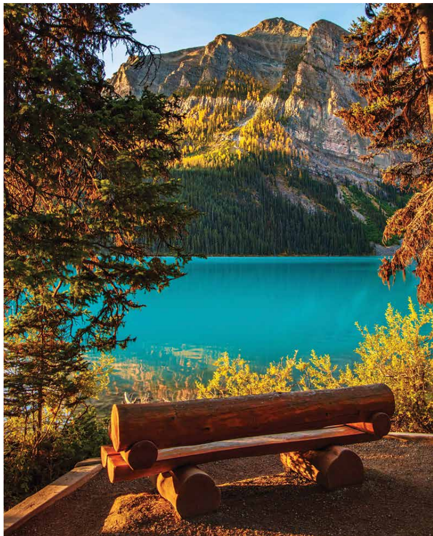
46 HOME BY DESIGN / The Bedroom Issue 2025